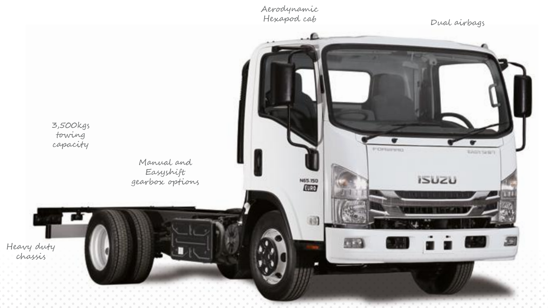
Keyless entry and immobiliser