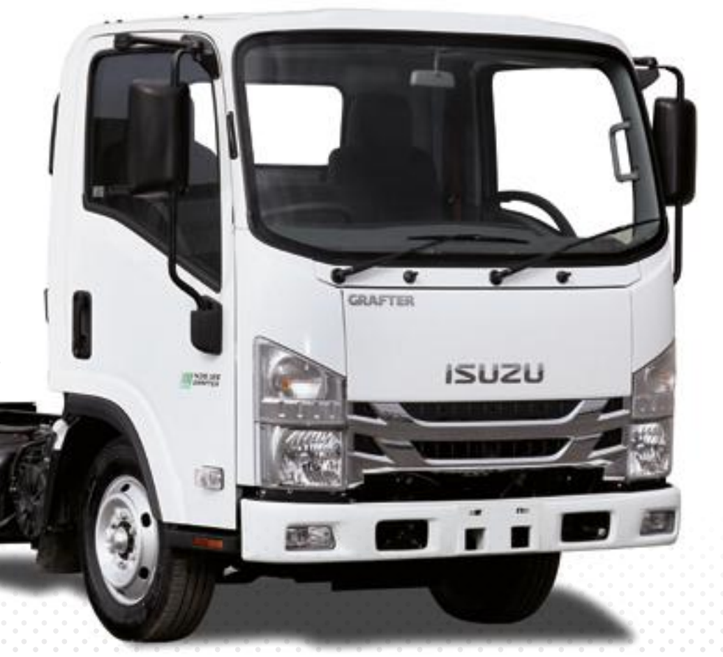
Keyless entry and immobiliser