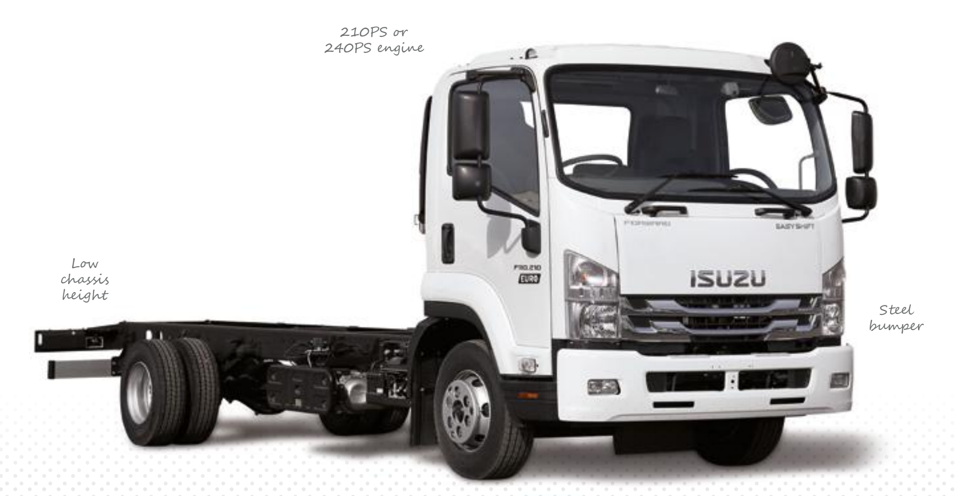
Keyless entry immobiliser